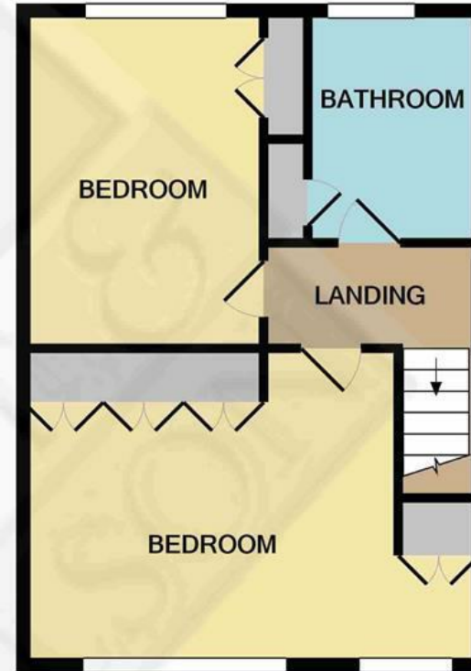
1ST FLOOR APPROX. FLOOR AREA 348 SQ.FT. (32.3 SQ.M.)

TOTAL APPROX. FLOOR AREA 815 SQ.FT. (75.7 SQ.M.)