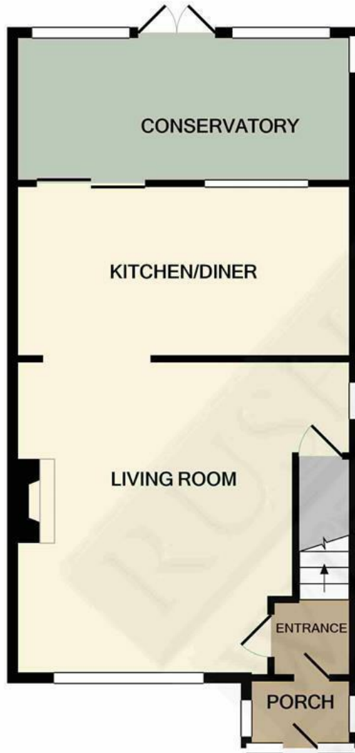
GROUND FLOOR APPROX. FLOOR AREA 467 SQ.FT. (43.4 SQ.M.)